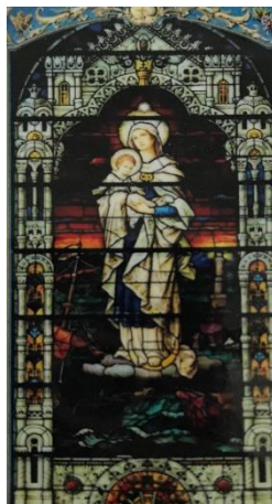
From a window in the Basilica of Saint Florida, USA.

Jesus had a divine will, and a human will. In his earthly life the Son of God humanly willed all that he had divinely decided with the Father and the Holy Spirit for our salvation. The human will of Christ followed without opposition or reluctance the Divine Will or, in other words, it was subject to it.